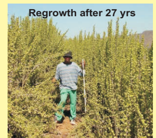
Regrowth after 27 yrs

To date, about 400 ha in the Baviaanskloof Nature Reserve (a World Heritage Site), the Addo Elephant National Park and the Great Fish River Reserve have been replanted. R3G has compiled a Project Design Document and is planning to generate carbon credits through the voluntary market from large-scale restoration achieved to date.