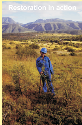
Restoration in action