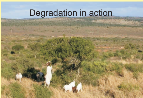
Degradation in action

The degradation of thicket veld The thicket vegetation of the south Eastern Cape is highly sensitive to overgrazing by livestock, especially by mohair-producing angoras. Heavy browsing by goats can convert dense shrubland into a desert-like system within ten years. Thicket exists in various forms, from low noorsveld to tall thicket with tree euphorbias and aloes. In the case of thicket rich in spekboom shrubs (igwanishe or Portulacaria afra ), approx. 46% of the original 16 000 square km has undergone severe degradation, and 34% has been subjected to moderate disturbance by overgrazing.